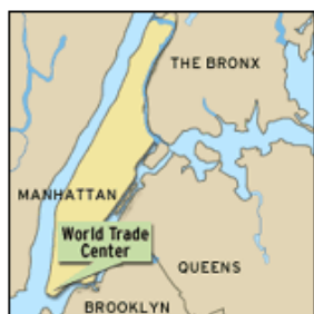
Two planes crashed into the World Trade Center.

The Boston Globe reported that a copy of the Koran, instructions on how to fly a commercial airplane and a fuel consumption calculator were found in a pair of bags meant for one of the hijacked flights that left from Logan.