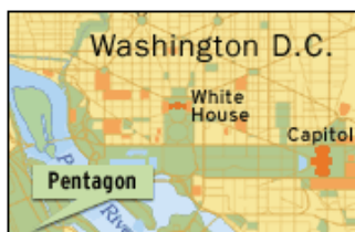
A plane crashed into the Pentagon.

Bin Laden has been indicted as the mastermind behind the 1998 attacks on U.S. embassies in Kenya and Tanzania, and quite possibly the deadly attack on the USS Cole last year. There is a $5 million price on his head.