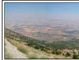
The family also had a home in Lebanon's Bekaa Valley, near the town of Al Marj.