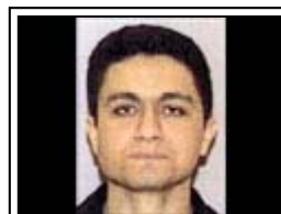
Mohamed Atta was a key organizer of the attacks, was studying urban planning at the Technical University.

Atta was the pilot who flew American Airlines flight 11 into the North Tower of the World Trade Center and Al-Shehhi was the pilot on United Air Lines flight 175 which flew into the South Tower of the World Trade Center.