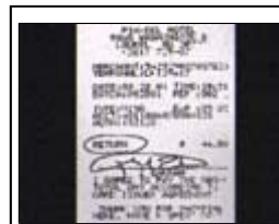
Receipt from the Del-Mar Motel, signed by Jarrah.