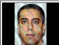
Photo of Ziad Samir Jarrah, released by the FBI on September 27, 2001.

On September 9 he made his final phone call to his family. He confirmed receipt of the money sent on the 4th. The family reported he was cheerful and normal and said he'd see them Sept. 22 for a family wedding. According to them, everything seemed normal.