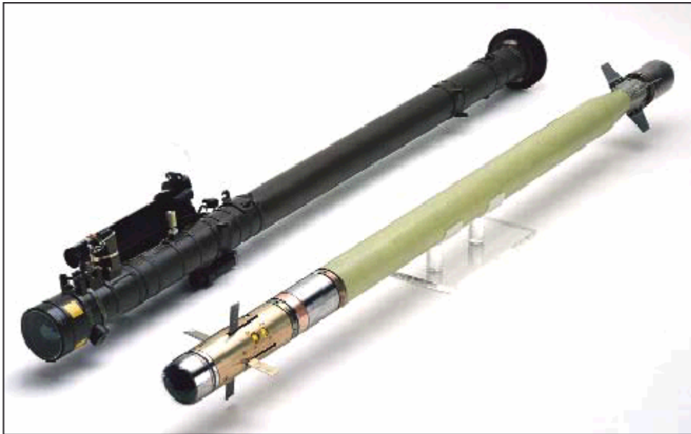
Figure 1. Stinger launch tube assembly (left) and Stinger missile round. 14

The Stinger is a heat-seeking, man-portable, air defense (MANPAD) missile. 11 The system consists of a reusable grip stock and a sealed launch tube with a five-foot-long missile. The grip stock and missile tube together weigh about 35 pounds. The weapon has a maximum altitude of about 10,000 feet, and a range of about five miles. Over 44,000 Stingers have been built. It is used by the U.S. Army (which plans to keep it in the inventory until at least 2018), the Marine Corps, and the Navy. 12 It is also used by numerous foreign nations. 13