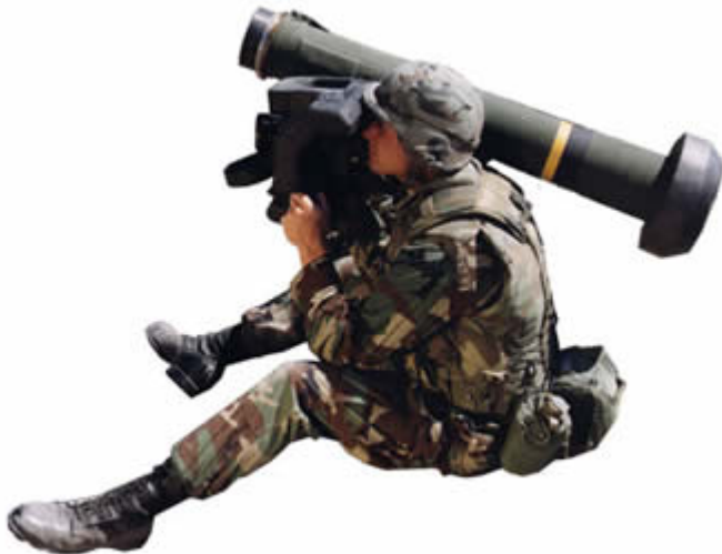
Figure 4. The Javelin gunner looks through the CLU. 55