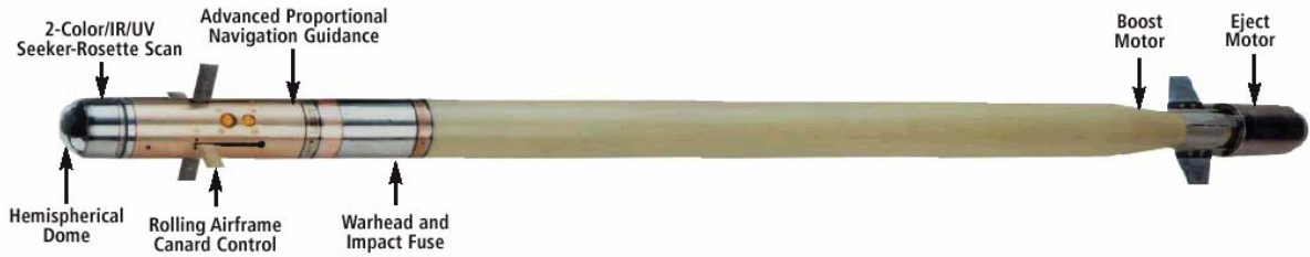
Figure 2. Stinger missile round. 15